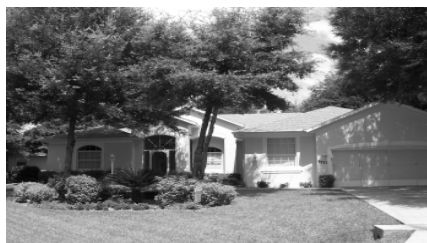
3 Bedrooms, 2 Baths, 2-car Garage 2,207 sf la—Priced at $249,000 Call Janet Pigeon 171/004