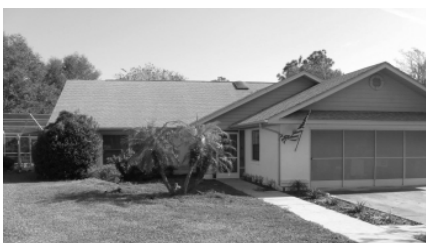
3 BR., 2 BA., 2-car Garage, Pool 1,928 sf la—Priced at $164,900 Call Dave Farrell 167/093