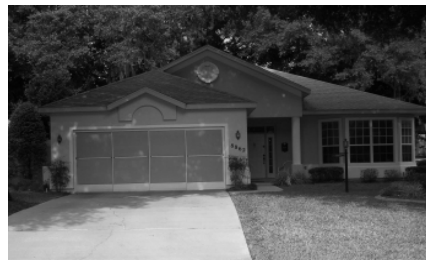
2 Bedrooms, 2 Baths, 2-car Garage 1,583 sf la—Priced at $179,000. Call Sharon Graley S/006