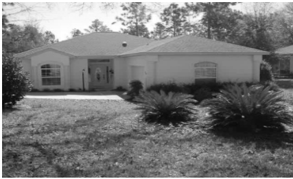
2 Br + Den, 2 Baths, 2-car Garage 1,700 sf la—Priced at $198,000. Call Yulee Commander 165/004