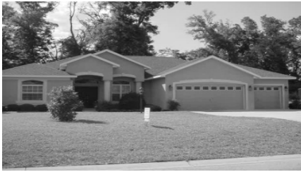
3 Bedrooms, 2 Baths, 2-car Garage 2,135 sf la—Priced at $288,000 Call Yulee Commander GP/060