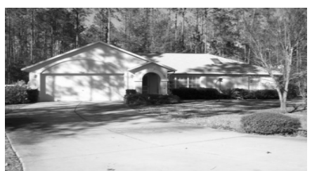
3 Bedrooms, 2 Baths, 2-car Garage 1,596 sf la—Priced at $179,000 Call Sharon Graley 142/034

Rainbow Springs Community Realty, Inc. only lists and sells properties in Rainbow Springs. If you want more showings on your home, call us at 352-489-2525. We are open 7 days a week and have sales associates on duty every day.