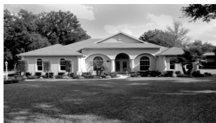
3 BR., 2 BA., 2-car Garage, Pool 2,544 sf la—Priced at $419,900 Call Carole Caird 156/021