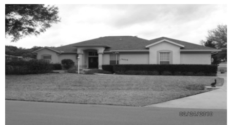
3 BR., 3 BA., 2-car Garage, Pool 2,805 sf la—Priced at $359,900 Call Dave Farrell FEW/008