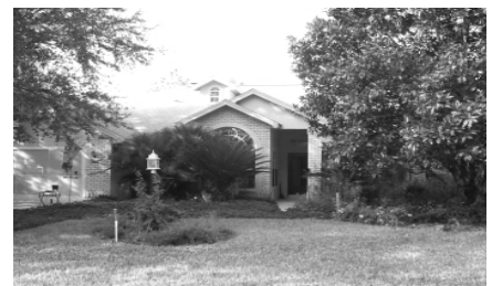
3 BR, 2 BA, 2-car Garage & Pool 1,748 sf la—Priced at $219,000. Call Janet Pigeon 168/034