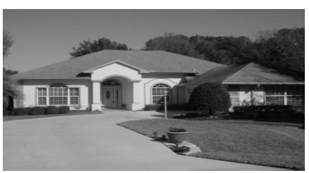
4 BR, 2.5 BA, 2-car Garage, Pool 2,604 sf la—Priced at $398,000 Call Yulee Commander FE/024