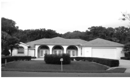
3 BR, 3 BA, 2+-car Garage & Pool 2,739 sf la—Priced at $280,000. Call Yulee Commander P/010