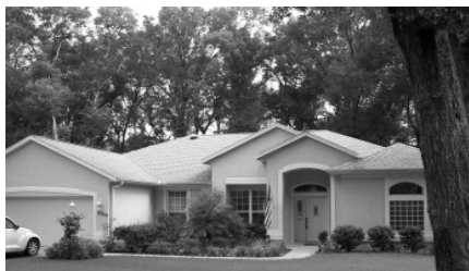
3 Br., 2 Ba., 2-car Garage, Pool 2,317 sf la—Priced at $309,900 Call Janet Pigeon P/003