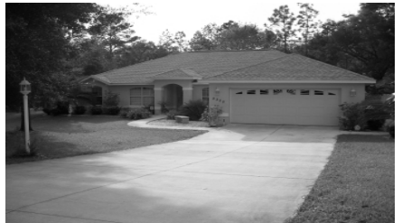
3 Bedrooms, 2 Baths, 2-car Garage 2,400 sf la—Priced at $269,000 Call Sharon Graley 061/015