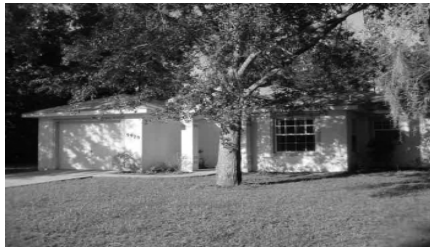
2 Bedrooms, 2 Baths, 1-car Garage 1,180 sf la—Priced at $130,000 Call Janet Pigeon 182/005