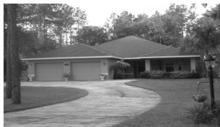
3 Bedrooms, 2 Baths, 2-car Garage 1,715 sf la—Priced at $189,000 Call Sharon Graley 142/015