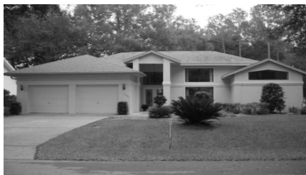
3 BR, 2 BA, 2-car Garage & Pool 1,887 sf la—Priced at $177,500 Call Yulee Commander M/009