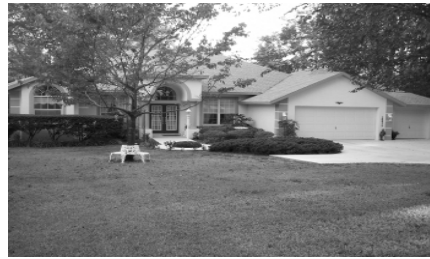
3 Bedrooms, 2.5 Baths, 2-car Garage 2,233 sf la—Priced at $274,000. Call Sharon Graley 154/012